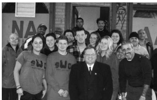
Pictured to right: Last Stop Recovery House residents and BCWSA employees at one of our Holiday drop offs.